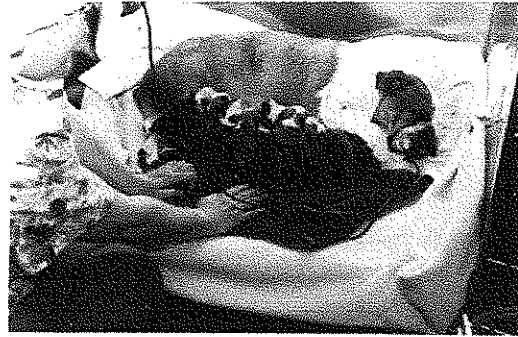
English Bulldog and puppies BVH, Massachusetts

"This stuff is so amazing. I just helped a Boston breeder with a fader—she did not believe anything could be done, but was willing to try something new (she had already bought a plant to put over the pups grave). The pup received Fresh-Frozen Plasma for 3 days. She can't believe the pup is still alive and is catching up to the other pups in weight. Thanks for another Happy Ending!" Chihuahua breeder from York Haven, PA