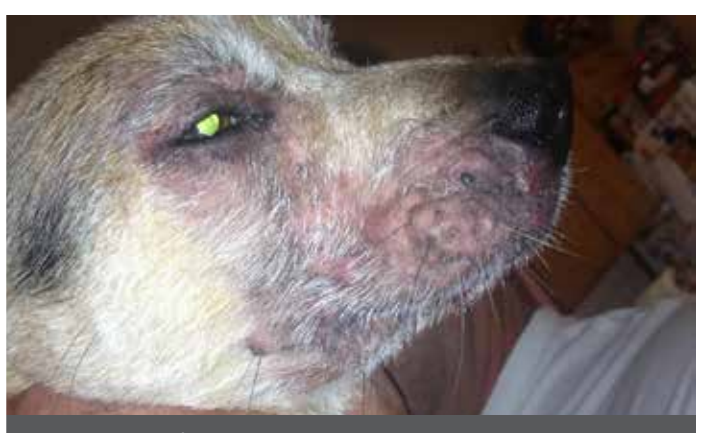
Figure 3a Aussie Before Nutriscan

The results presented here using a novel saliva-based test which quantified the IgA and IgM antibody responses to 24 affinity-purified food antigens convincingly demonstrated the clinical predictability, utility, and efficacy of the assay (Tables 4 and 5; Figures 2 and 3). As shown in Table 5, the assay was repeated once more in 15 cases, 2-6 months after the identified offending foods had been completely removed from the diet. In each case, the clinical outcome was stated to be very good (5 cases) and excellent (10 cases). Even though some of the initially reactive foods were still quantified as reactive on retesting (at or above 11.5 units/mL), the degree of reactivity was lower. It is interesting that on repeat testing, some other food antigens were quantified as reactive, suggesting that these dogs could be especially prone to developing food intolerances. Several possible explanations for the ongoing but lowered reactivity of initially reactive