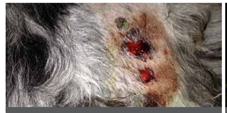
Figure 3b Aussie Skin & Muscle Before Nutriscan