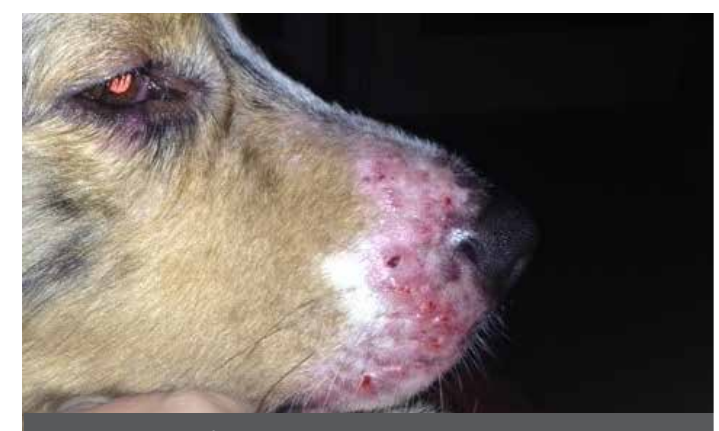
Figure 3a: Aussie Before Nutriscan