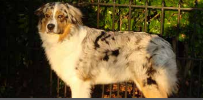
Figure 3b Aussie After Nutrscan & Reactive Food Removal

food antigens and the appearance of additional reactive foods include: initial reactions were actually to residues in the flesh from what the meat or fish ate before becoming a food source; and reactive foods were still present albeit it in presumed smaller amounts in supplements the dog still ate, such as chicken fat, cornstarch, and fish oils (1, 2, 15–18).