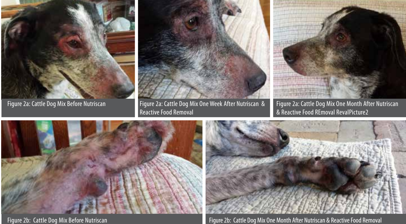
Figure 2b: Cattle Dog Mix Before Nutriscan

remarkable beneficial effects were clearly seen within 2 weeks of the diet changes, and the original issues were completely resolved within a month.